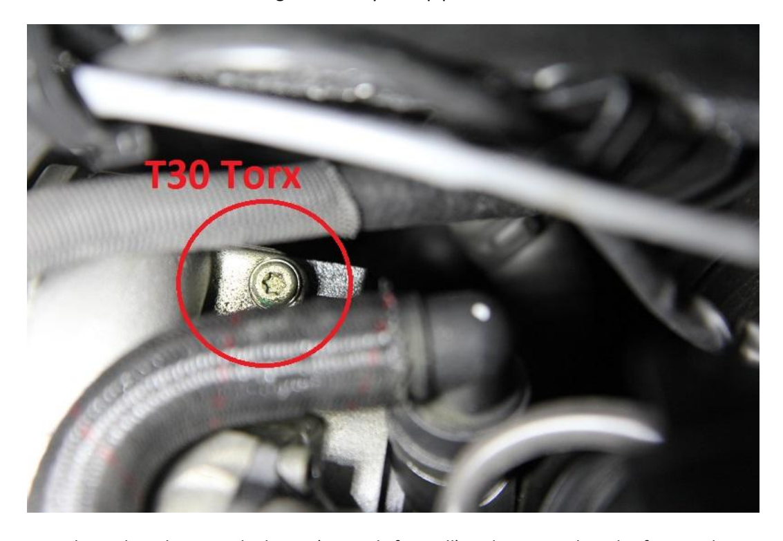
Turn the turbo inlet pipe clockwise (towards firewall) and remove the inlet from turbo.

Remove the T30 screws holding the factory inlet pipe to the turbo. Bolt does not need to be removed.