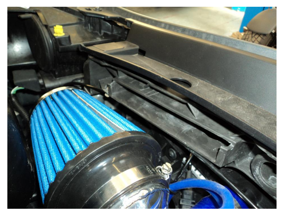
Thank you for choosing Forge Motorsport products.