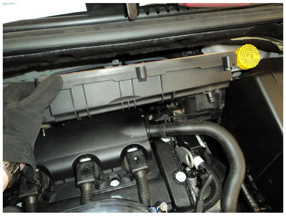
11. Assemble the Forge intake as shown below

10. Remove the bottom of the air box by pulling upwards to realease it from its rubber mounts, and remove it from the car.