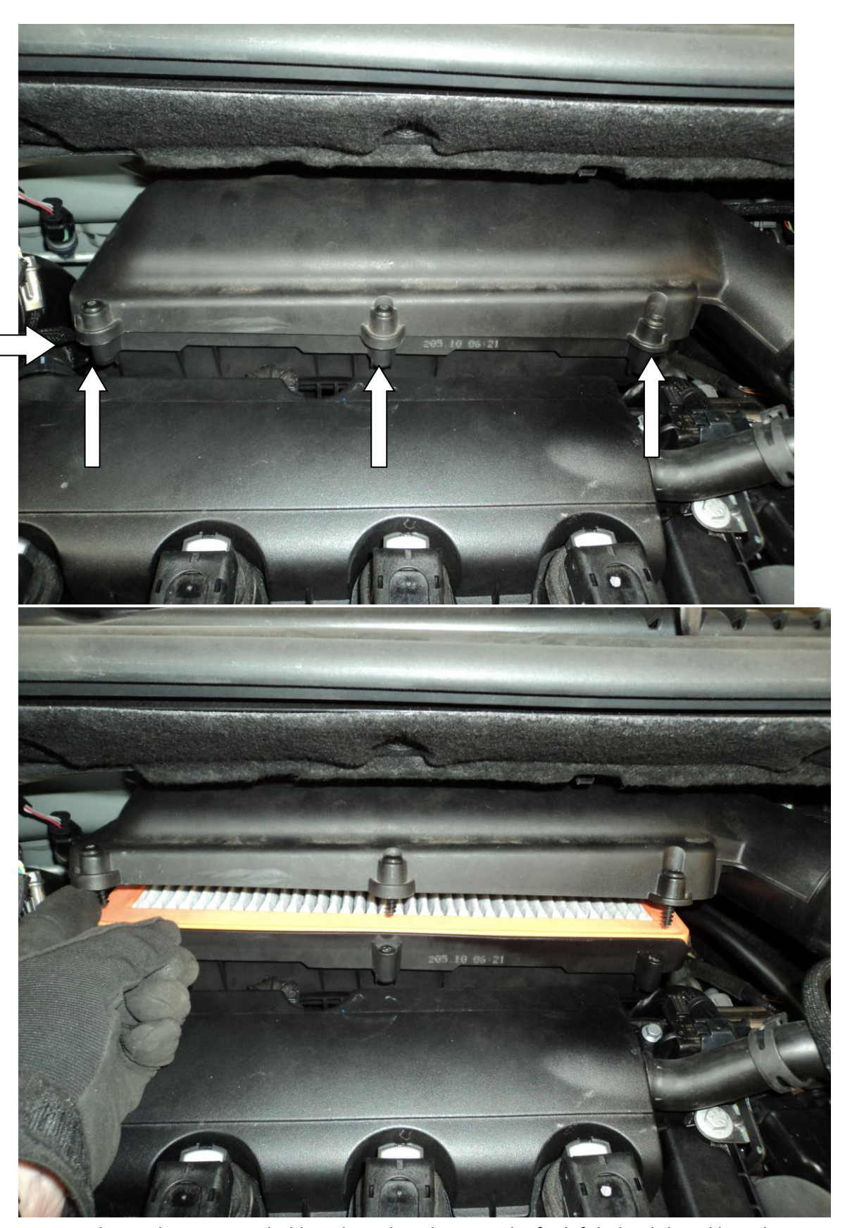
9. Remove the single T25 screw holding the airbox down on the far left behind the oil breather pipe.